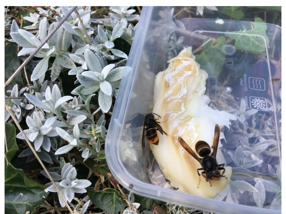
Figure 1: Asian hornet

The impact on bees and other pollinating insects posed by the Asian hornet is potentially serious. An <u>Asian Hornet Contingency Plan</u> for England and Wales is in place, detailing the steps to be taken in the event of an outbreak.