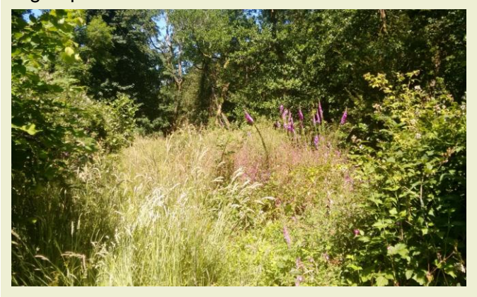
Figure 5: Afon Gwaun, the same site in July 2018

From March 2018 the site was visited twice a month. By the time July arrived there was the odd rogue plant.