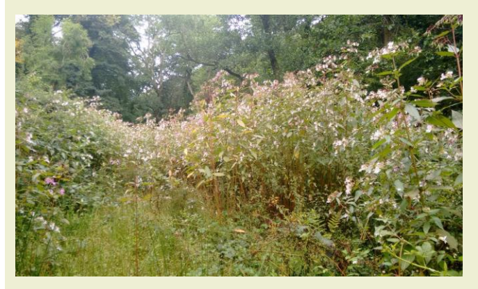
Figure 4: Himalayan balsam at Afon Gwaun in August 2017

Balsam control is underway on approx. 9 hectares in the catchment varying in habitat types. The pictures below were taken in the Afon Gwaun and show a great example of how quickly the problem can be stitched in time .