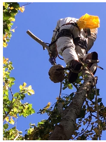
Figure 2: Asian hornet control © The Animal and Plant Health Agency (APHA)

No Asian hornets have been seen in the UK since 14th October. The risk of an active Asian hornet nest being found in the UK is now negligible as Asian hornets are not active during the colder winter months. There continues to be a risk of accidental transport of an Asian hornet queen.